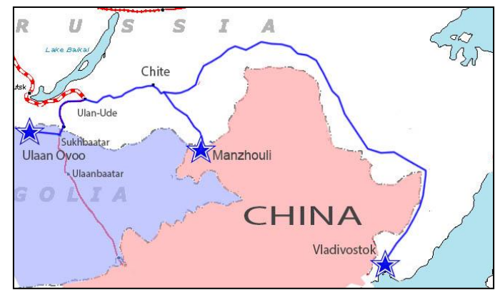
Mongolia, Russia & China (via Manzhouli)