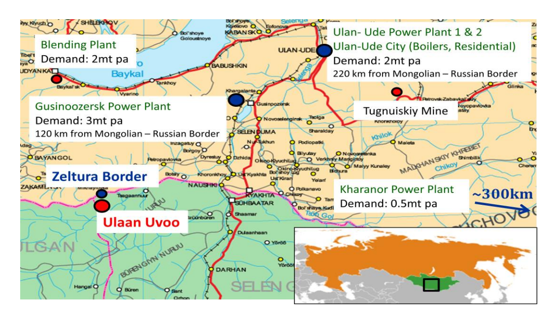
Prophecy's Coal in Wagons from Sukhbaatar Siding